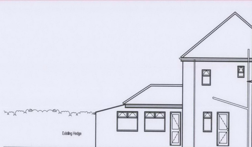
Existing Side Elevation ( from no.6 )