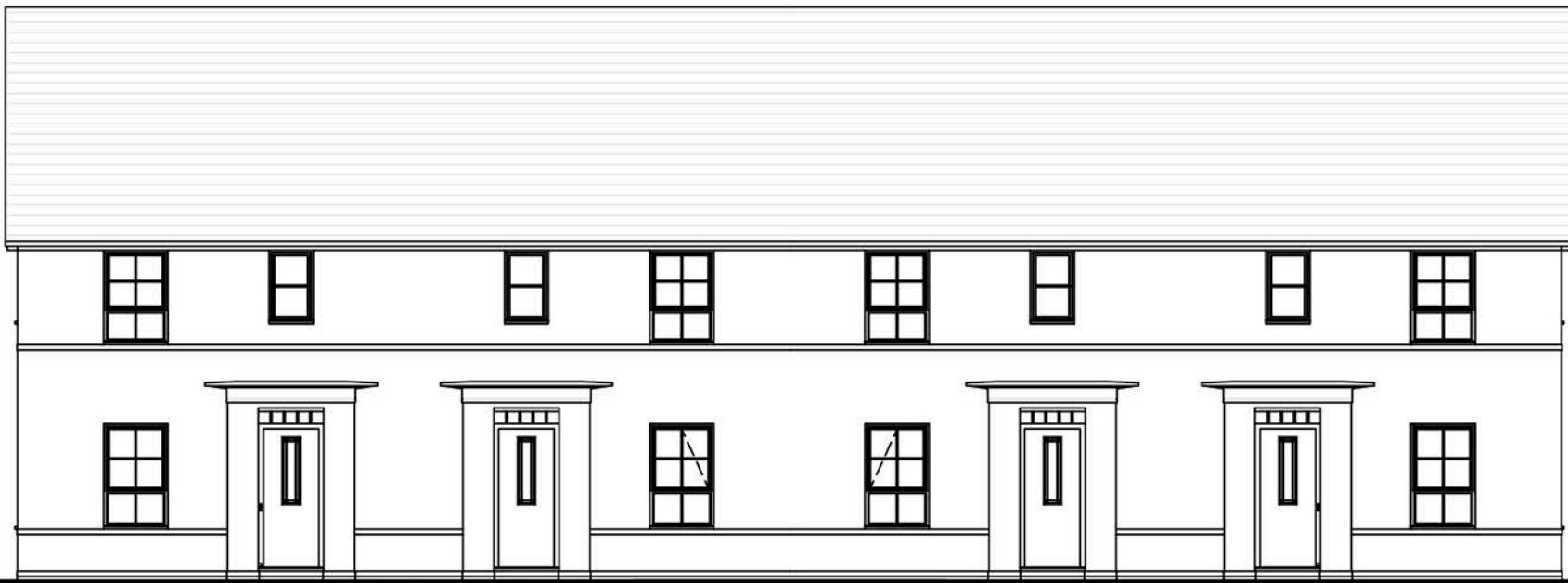
REAR ELEVATION Type Acomb (end/mid)