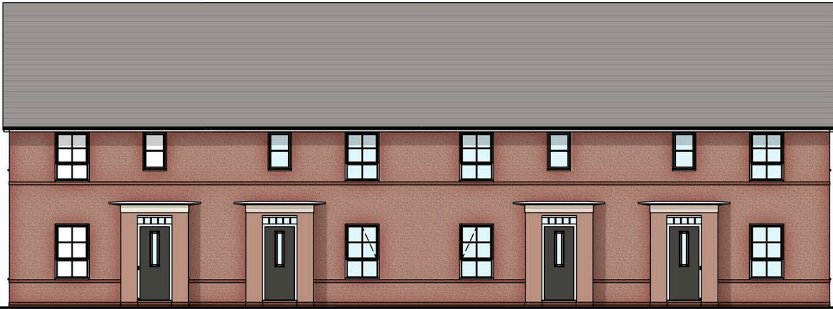
FRONT ELEVATION Type Acomb (end/mid)