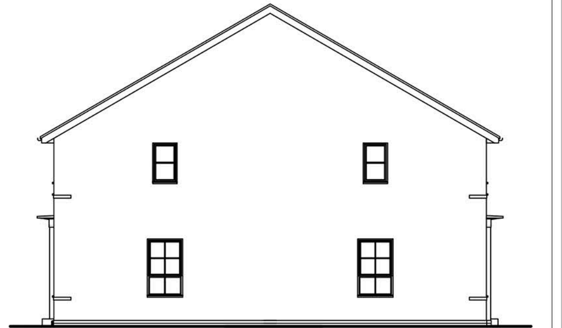
SIDE ELEVATION Type Acomb (end/mid)