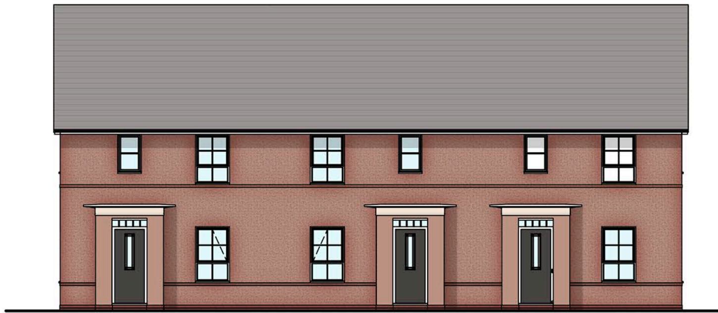
FRONT ELEVATION Type Acomb (end/mid)