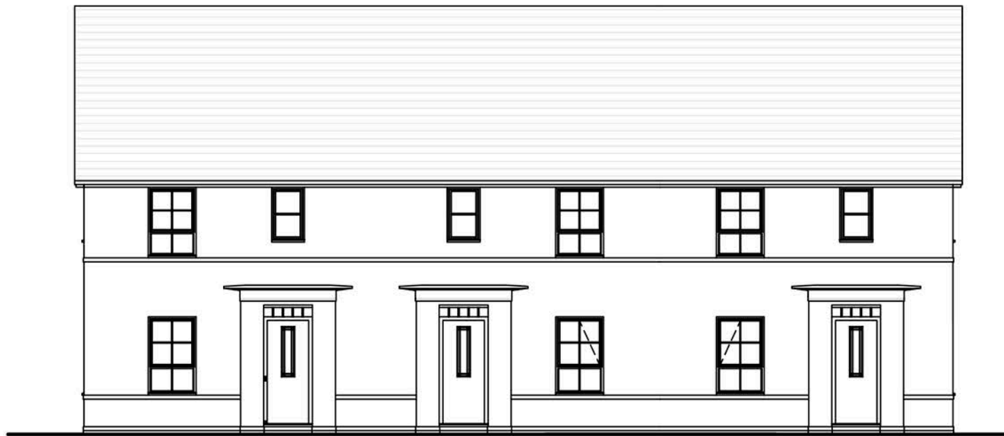
REAR ELEVATION Type Acomb (end/mid)