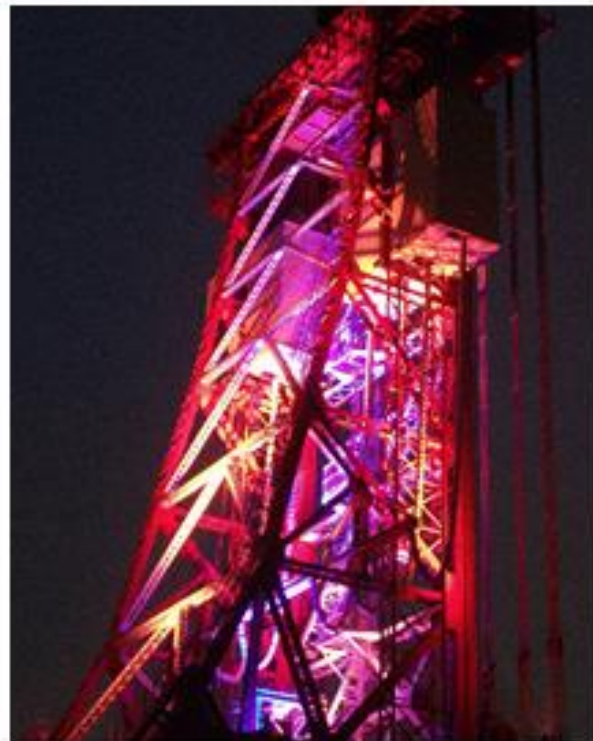
View of main tower from side view point