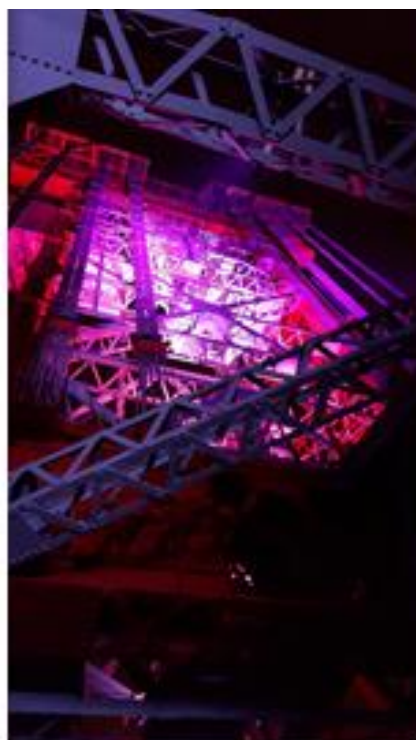
Lighting to inner elevation of main tower with supplementary luminaires attached to cross strut