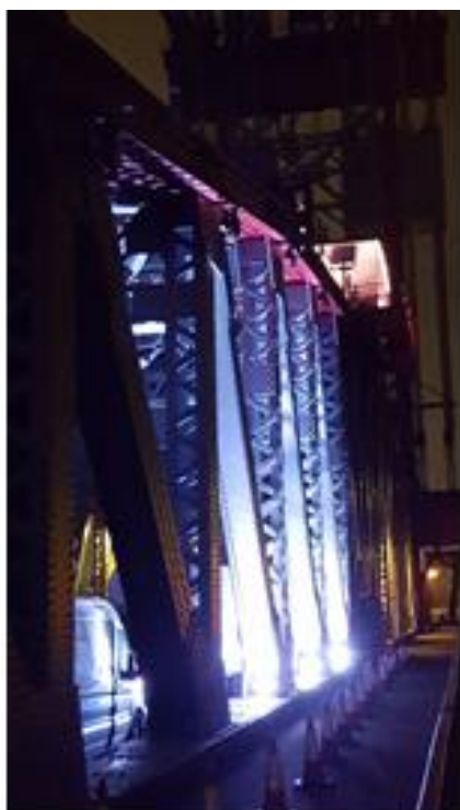
Lighting to main span. For the demonstration the lighting was upward for ease (proposed scheme is inverted)