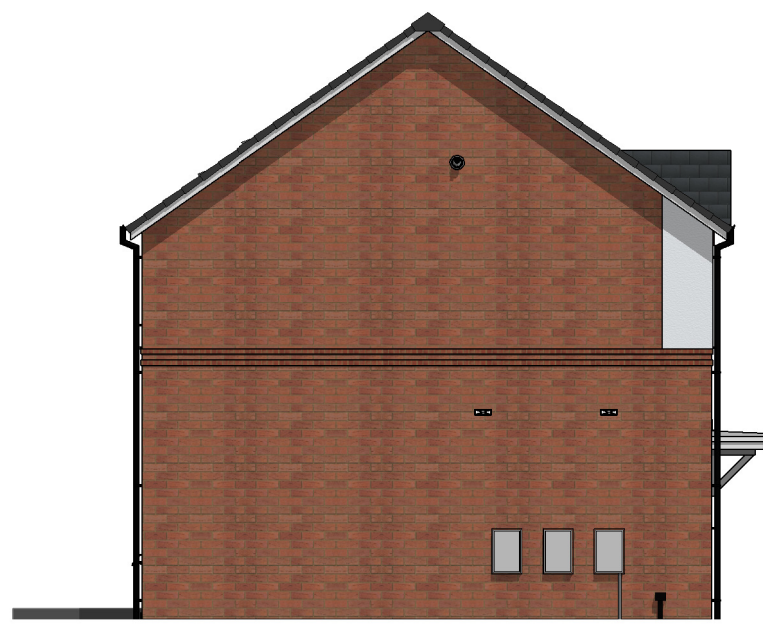
Left Side Elevation. 1 : 100