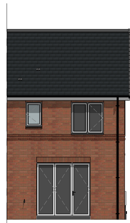
Rear Elevation. 1 : 100