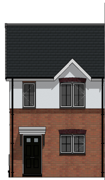
Front Elevation. 1 : 100