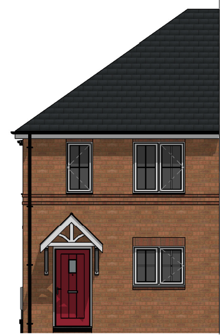
Front Elevation. 1 : 100