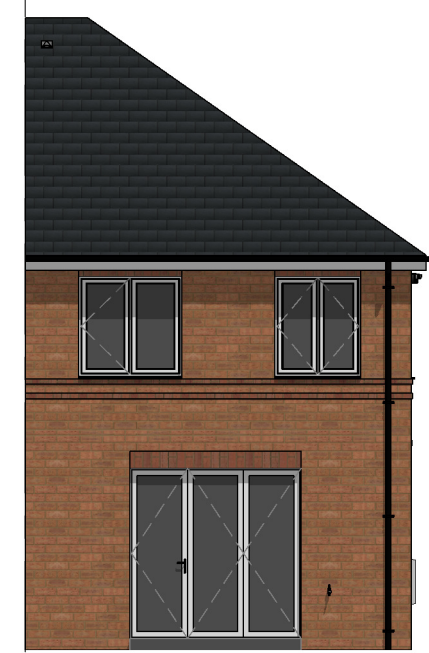
Rear Elevation. 1 : 100