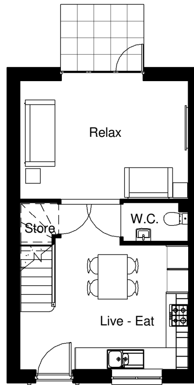
Ground Floor. 1 : 100