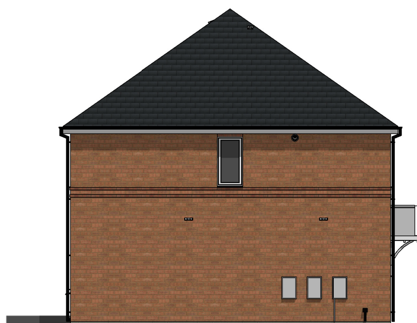
Left Elevation. 1 : 100