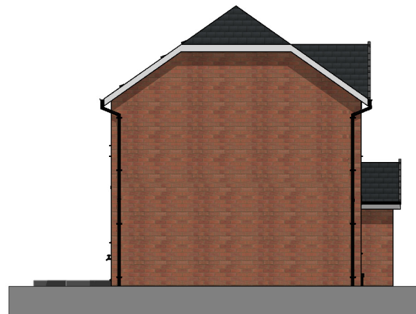
Left Side Elevation. 1 : 150