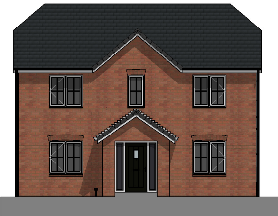
Front Elevation. 1 : 150