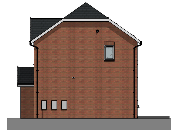
Right Side Elevation. 1 : 150