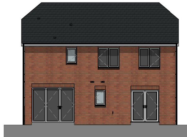
Rear Elevation. 1 : 150