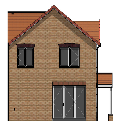
Rear Elevation. 1 : 150

DEVELOPMENT SITE: Summerville - Bridge Range