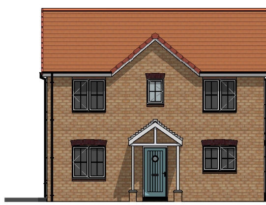
Left Side Elevation. 1 : 150