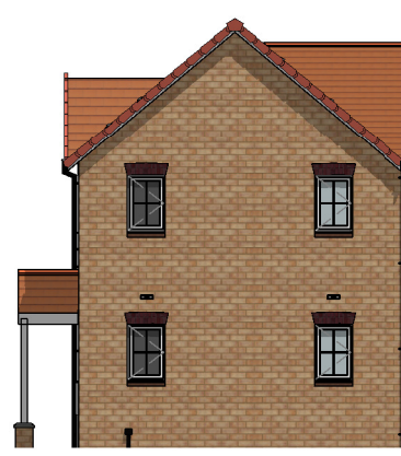
Front Elevation. 1 : 150