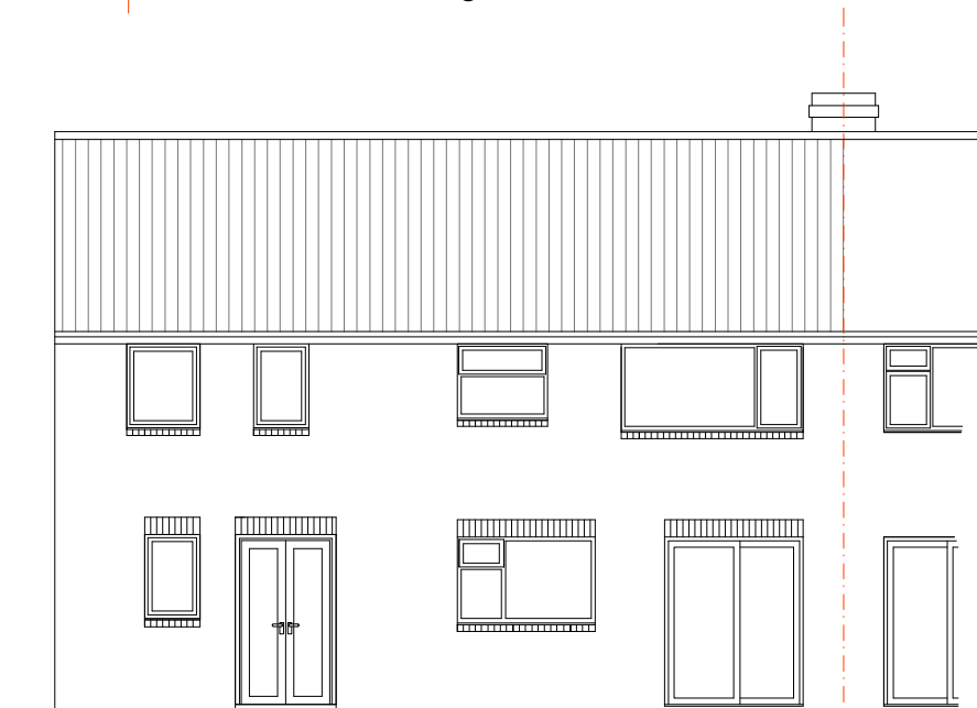
Rear Elevation as Existing

Existing Materials Walls - Facing brickwork Roof - Brown profiled concrete tiles Windows and Doors - White uPVC