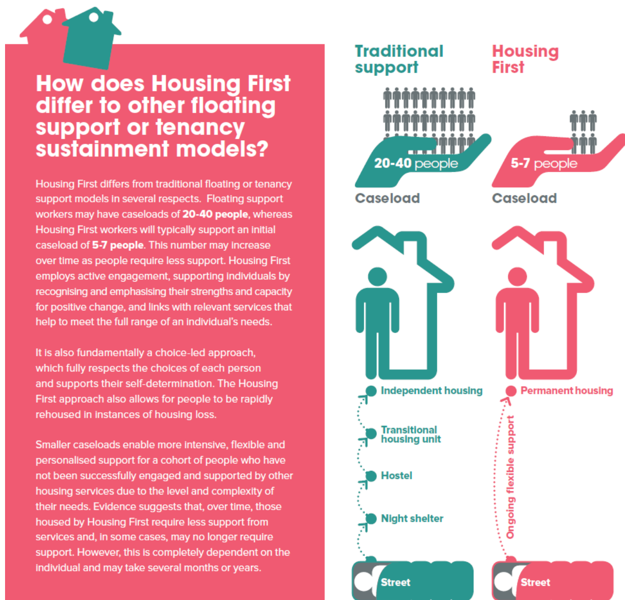
Housing First in England – The Principles (Homeless Link: 2016)

4.40 Support workers have a smaller case load of clients than in other models: